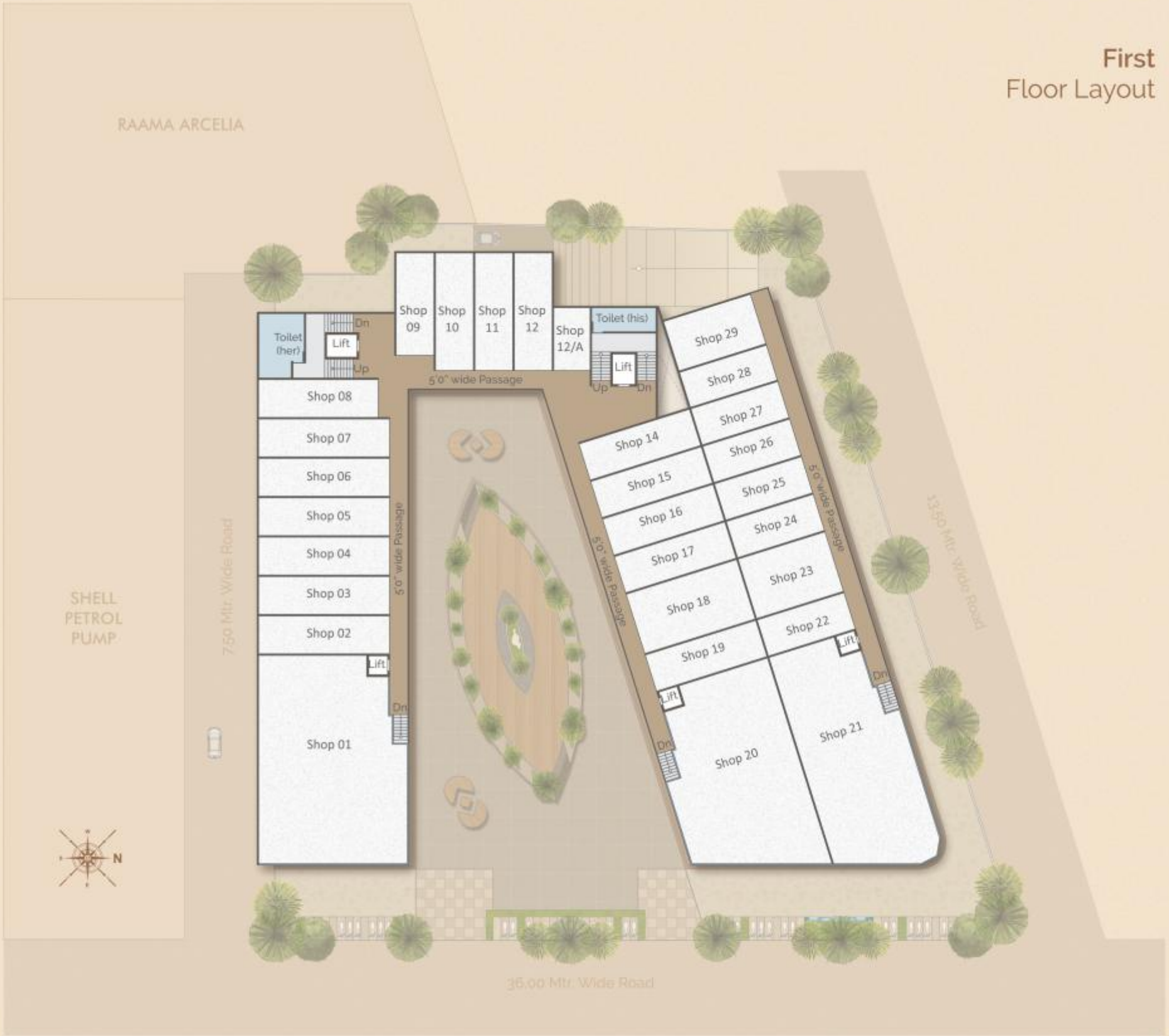
First Floor Layout